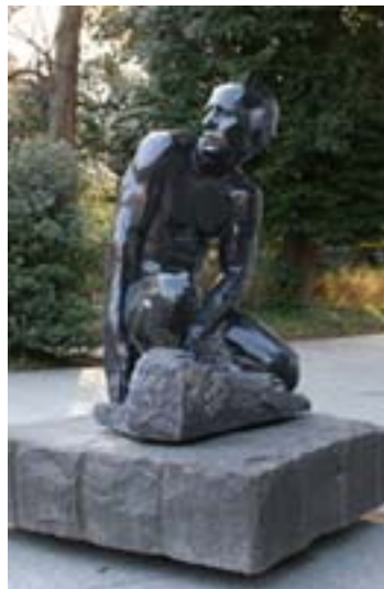
Black Gaze 1 by Sequoyah Aono