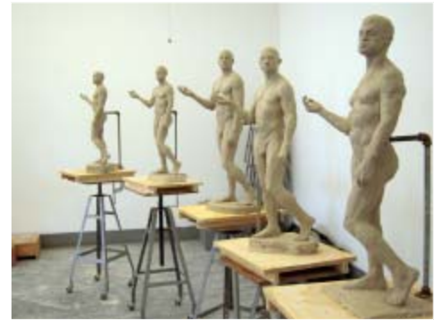
Other images: Days 1 - 5 of the competition